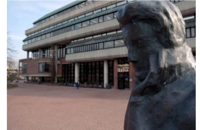
University Library with Statue of Heinrich Heine