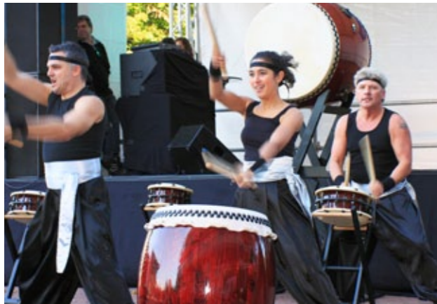
TAIKO – Japanese Drumming