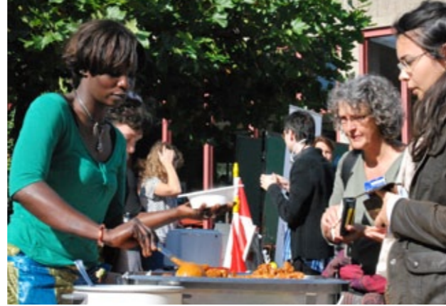
International Food on the „Day of the University“