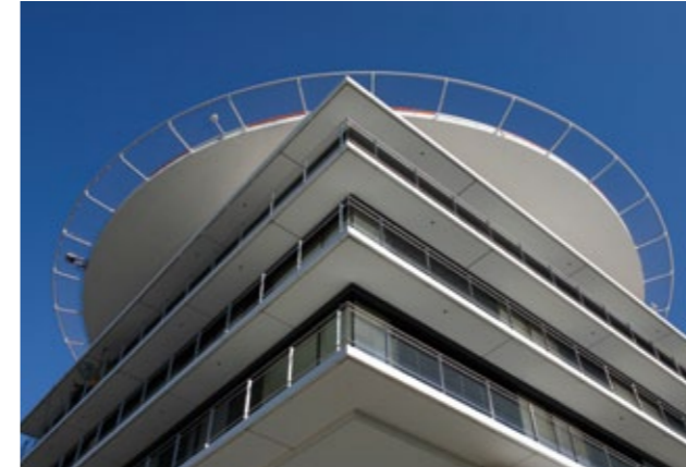
Center for Operative Medicine