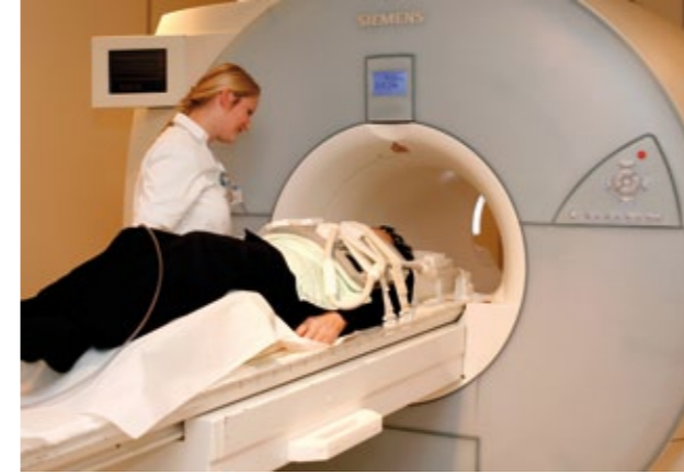
Magnetic Resonance Imaging (MRI) at the University Hospital