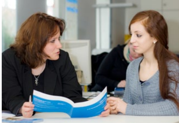
Coaching at the Student Service Center