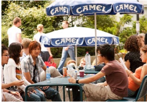
International Student Life