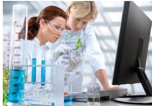
Plant Biology Research