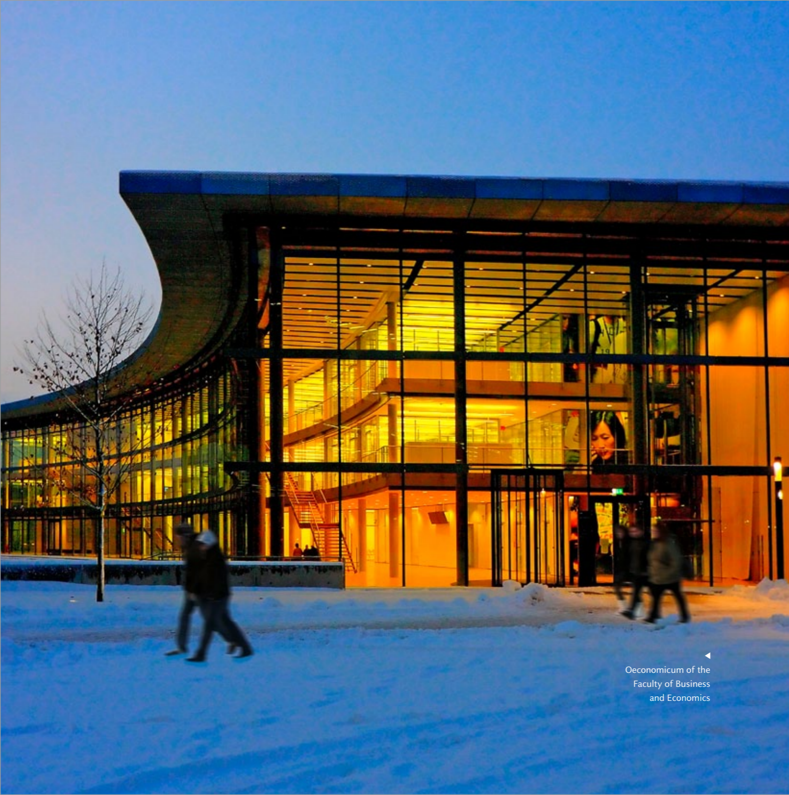
◀ Oeconomicum of the Faculty of Business and Economics