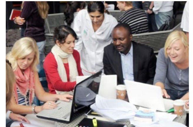
International Graduate School